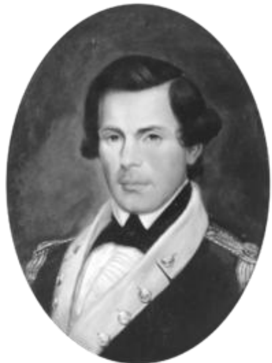
A portrait of Major Samuel Nicholas, the first Commandant of the Marine Corps, 1775.

Resolved, That two Battalions of marines be raised, consisting of one Colonel, two Lieutenant Colonels, two Majors, and other officers as usual in other regiments; and that they consist of an equal number of privates with other battalions; that particular care be taken, that no persons be appointed to office, or enlisted into said Battalions, but such as are good seamen, or so acquainted with maritime affairs as to be able to serve to advantage by sea when required; that they be enlisted and commissioned to serve for and during the present war between Great Britain and the colonies, unless dismissed by order